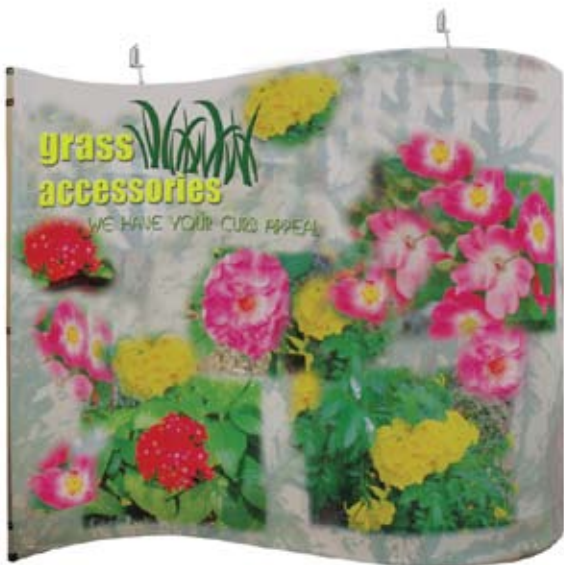
Full Graphic Fabric™